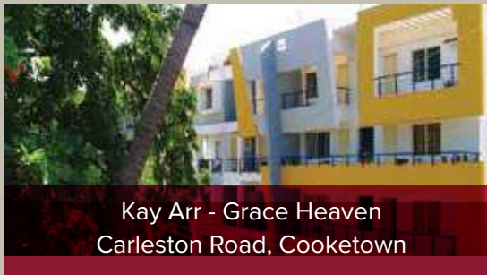
Kay Arr - Grace Heaven Carlestone Road, Cooketown