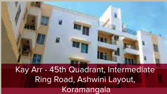
Kay Arr - 45th Quadrant, Intermediate Ring Road, Ashwini Layout, Koramangala