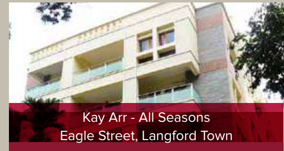
Kay Arr - All Seasons Eagle Street, Langford Town