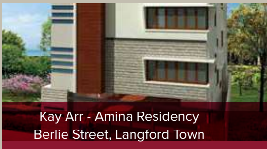
Kay Arr - Amina Residency Berlie Street, Langford Town