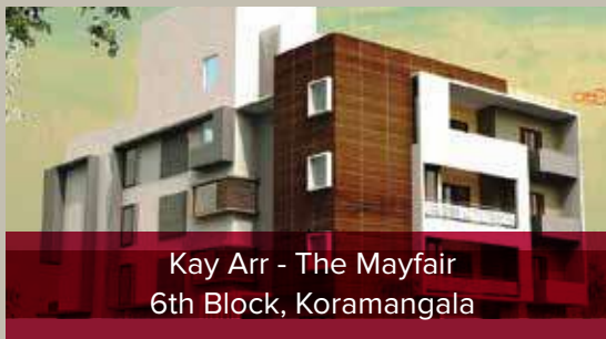
Kay Arr - The Mayfair 6th Block, Koramangala