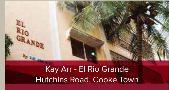
Kay Arr - El Rio Grande Hutchins Road, Cooke Town