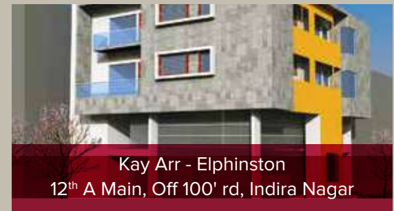
Kay Arr - Elphinston 12 th A Main, Off 100' rd, Indira Nagar