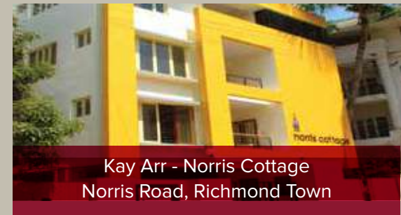
Kay Arr - Norris Cottage Norris Road, Richmond Town