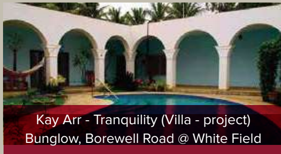
Kay Arr - Tranquility (Villa - project) Bungalow, Borewell Road @ White Field