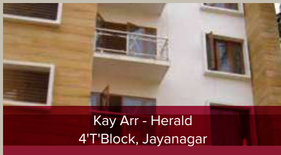
4'T'Block, Jayanagar