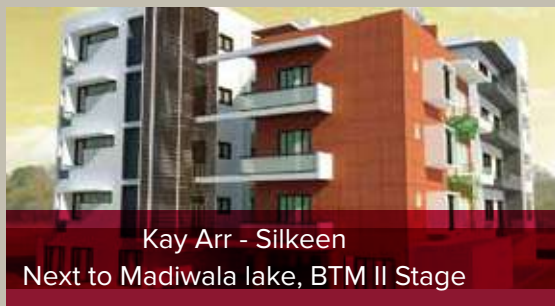
Kay Arr - Silkeen Next to Madiwala lake, BTM II Stage