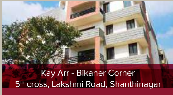
Kay Arr - Bikaner Corner 5 th cross, Lakshmi Road, Shanthinagar