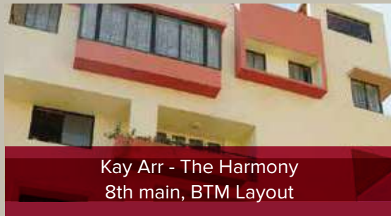
Kay Arr - The Harmony 8th main, BTM Layout