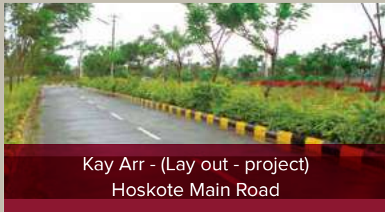
Kay Arr - (Lay out - project) Hoskote Main Road