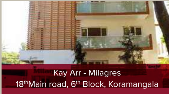
Kay Arr - Milagres 18 th Main road, 6 th Block, Koramangala