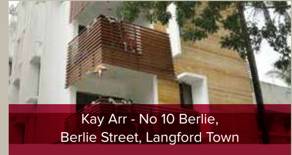
Kay Arr - No 10 Berlie, Berlie Street, Langford Town