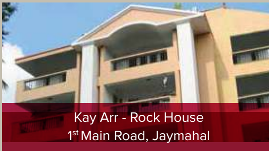
Kay Arr - Rock House 1 st Main Road, Jaymahal