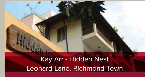
Kay Arr - Hidden Nest Leonard Lane, Richmond Town